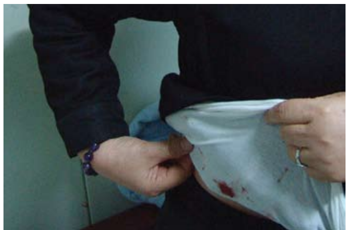
Bleeding from her side