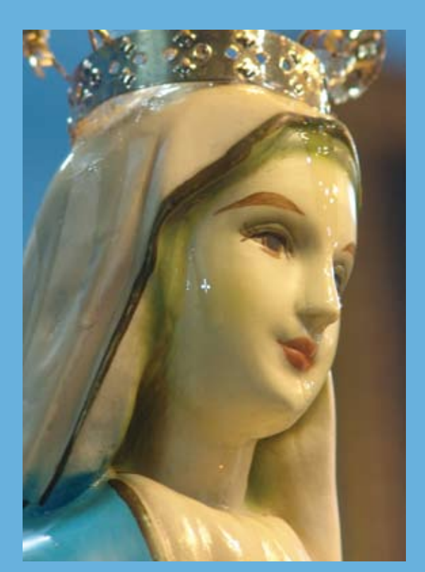
The Blessed Mother exuding fragrant oil through her statue in Naju (Oct 2, 2005)