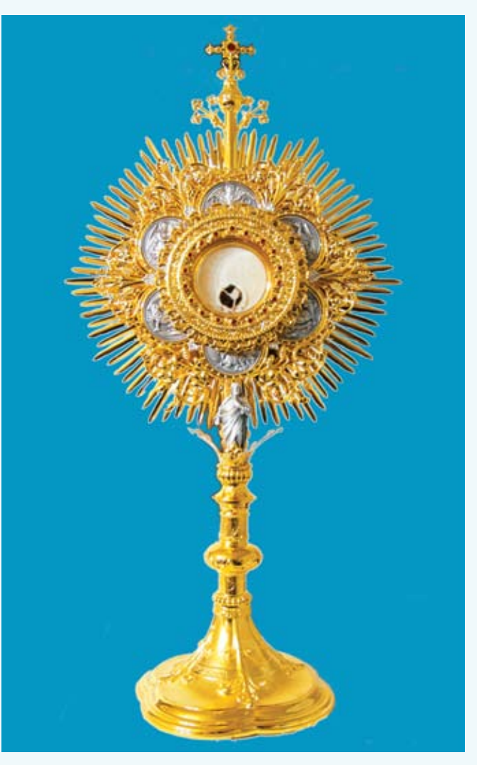
The Sacred Host that had come down from heaven on April 16, 2005 exuded the Precious Blood on May 6 of the same year and the other Sacred Host came down miraculously on the Blessed Mother's House on October 24, 2006.