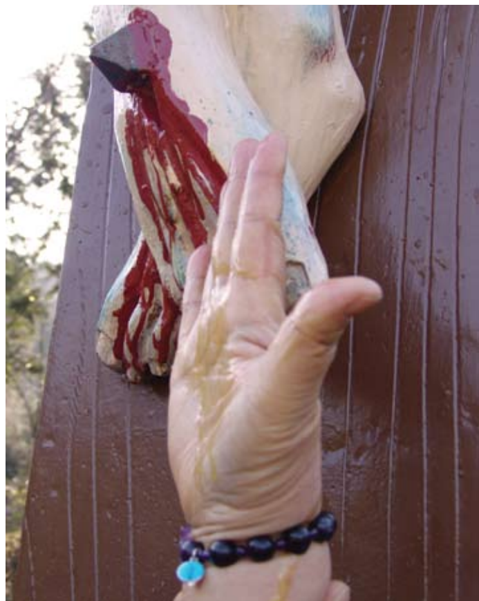
Golden-color fragrant oil exuded from the Crucifix on the Blessed Mother's Mountain in Naju. When Julia touched Our Lord's foot, her hand became wet with the fragrant oil.