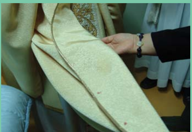
Archbishop Isabelo from Philippines testified that he had just witnessed the Precious Blood of Our Lord that had miraculously come down.