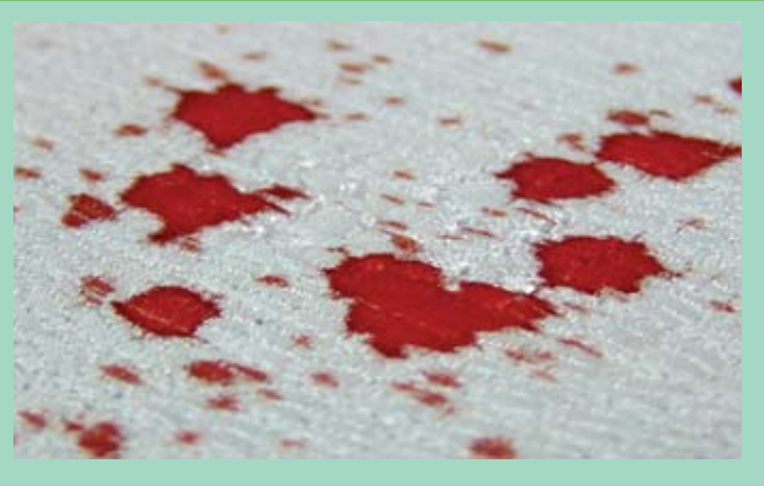
On October 13, 2006, several people found many drops of the fresh Precious Blood showered down on the mattress in Julia's room.