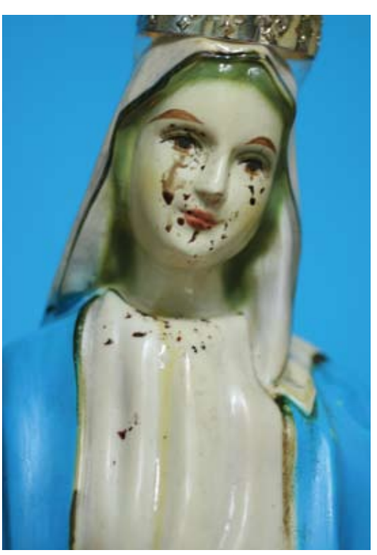
June 3, 2006

about to finish the rosary prayer, I noticed that it was suddenly becoming bright before me and looked up. At the location of the Crucifix on Mt. Calvary, I did not see the Crucifix any longer but instead saw the resurrected Jesus wearing a white robe and a red mantle. He shined the light of mercy on all of us from His raised hands. There also was the Blessed Mother wearing a blue mantle, smiling and looking so beautiful on the right side of Jesus. She blessed all by stretching out her hands. I was so fascinated and looked at the vision intently for a while. At that moment, Jesus smiled with satisfaction and began speaking with a kind voice.