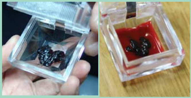
On October 14, 2006, the Precious Blood came down in the coagulated form in the shape of a heart. After it was placed in a case, it liquified.