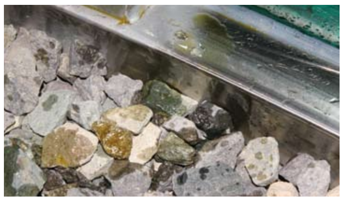
Fragrant oil that came down on the Blessed Mother's mountain

Suddenly, the water of mercy came down like a misty rain and also in larger drops making sounds of falling on the ground. When we were finishing the rosary prayer, Jesus on the Crucifix on Calvary Hill radiated powerful rays of the light of mercy on all gathered on the Blessed Mother's Mountain.