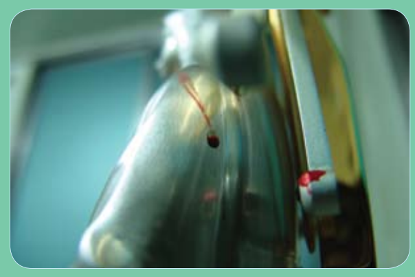
August 15, 2006, The Lord's Precious Blood came down in Chapel on the mountain