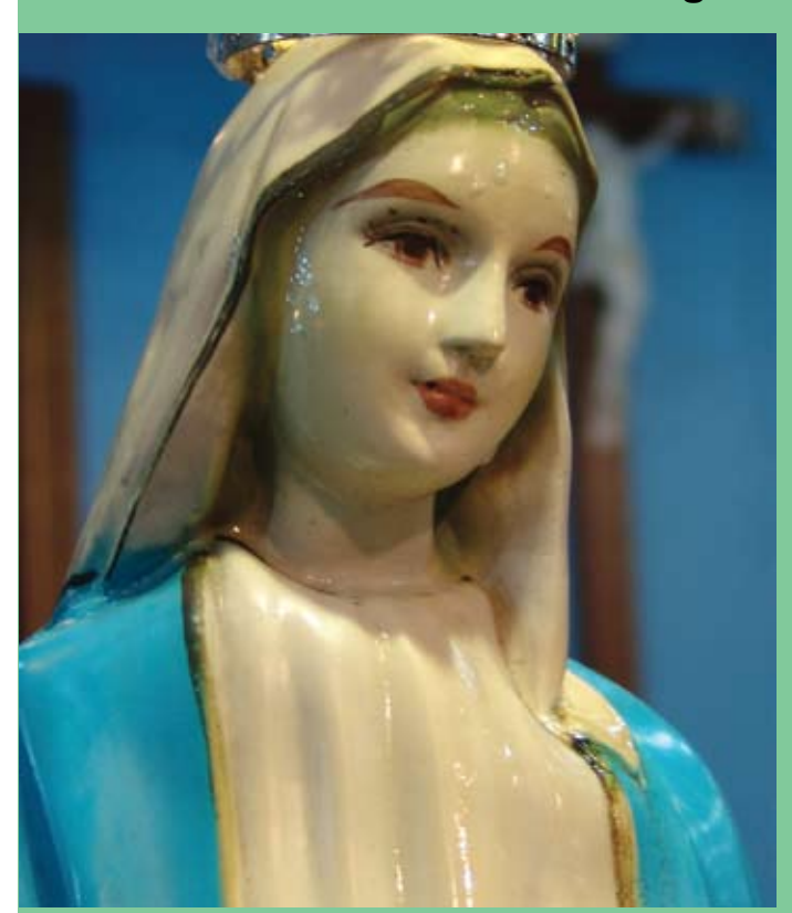
The Blessed Mother exuding fragrant oil through her statue in Naju (October 7, 2006)