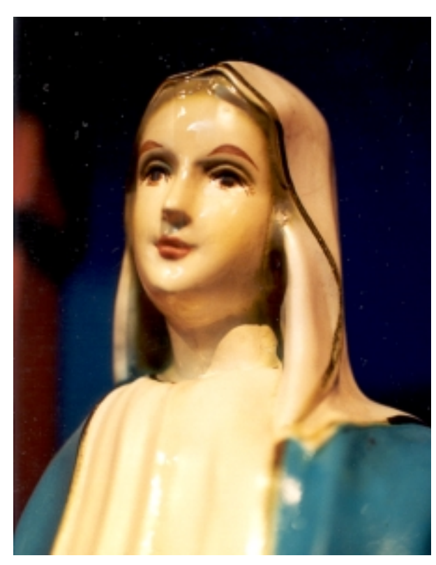
The Blessed Mother's statue in Naju exuded fragrant oil for 700 consecutive days from November 24, 1992, to October 23, 1994. In her message, she said that the oil and the fragrance of roses are signs of her presence, friendship, and love.

Especially when God works some physical miracles (such as tears from a statue, miraculous changes of the Eucharist into visible flesh and blood, miraculous healings of incurable illnesses, and so on, which lend themselves to scientific investigations to exclude the possibility of natural causes) to accompany His messages, we are under a special obligation to sincerely study these messages and act upon them, not only by the force of our consciences but also because of our obligation to respect the dignity of God's act and His ardent Will to save us. Authentic miracles are heavenly seals attached to the messages and, thus, enhance the credibility and dignity of the messages immeasurably. The recurring miraculous signs in Church history, especially in the lives of the Saints and during Our Lady's apparitions, are also the pulse and breath, so to speak, of the divine reality present and at work in the Church to direct and strengthen her. To accept God's miracles is to recognize this reality, while