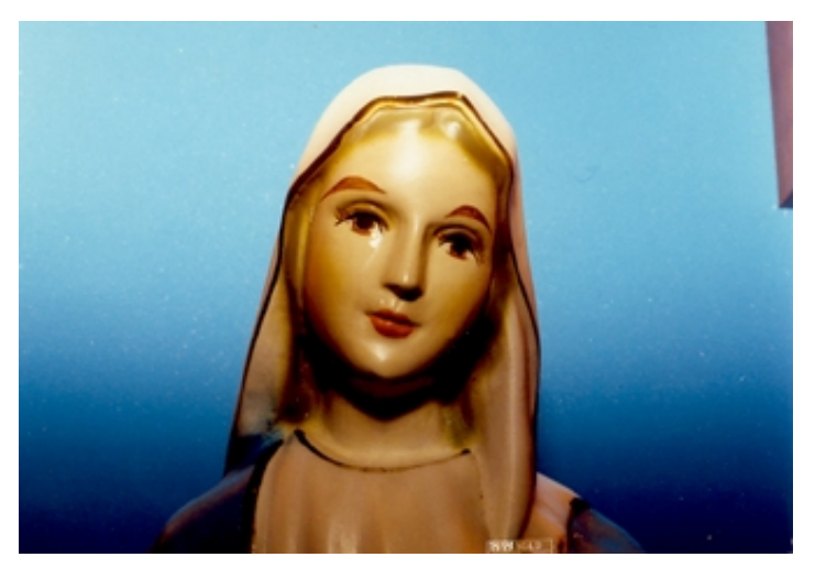
On January 14, 1992, the Blessed Mother wept for the last time in Naju after a total of 700 days of weeping since June 30, 1985.

To order more of this Special Issue, $6 for 10 copies, $18 for 50 copies, $28 for 100, $80 for 300 copies, $120 for 500, $200 for 1000 copies. (These amounts include shipping and handling charges in the USA.)