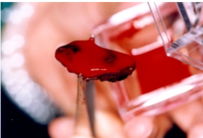
Blood on one of the rocks collected on August 15, 2002, first solidified, but later liquefied repeatedly for the next several months. DNA tests at Seoul National University Medical Center found the blood of two human persons, a male with blood type AB and a female with blood type B (genetically, BO).

Also, it seems important for us to recognize that the true special revelations do not originate from the humans who are only God's instruments and servants, but from God Himself, and, therefore, we have a special obligation to our consciences that become aware of divine will and power at work behind the messages and miraculous signs.