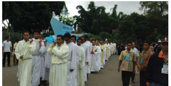
The Bishop, priests, and Julia following the Blessed Mother in her Ark of Salvation into the new church (March 25, 2007)