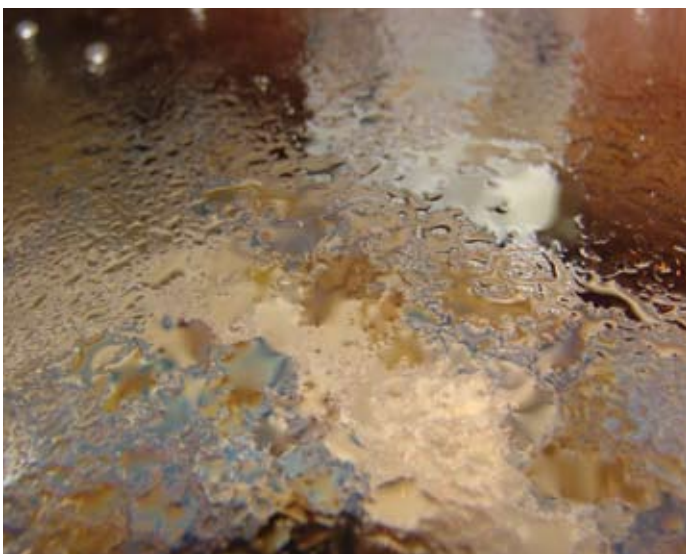
Fragrant oil that came down on the spot where the Holy Eucharist had descended in the Chapel in Naju on August 27, 1997.