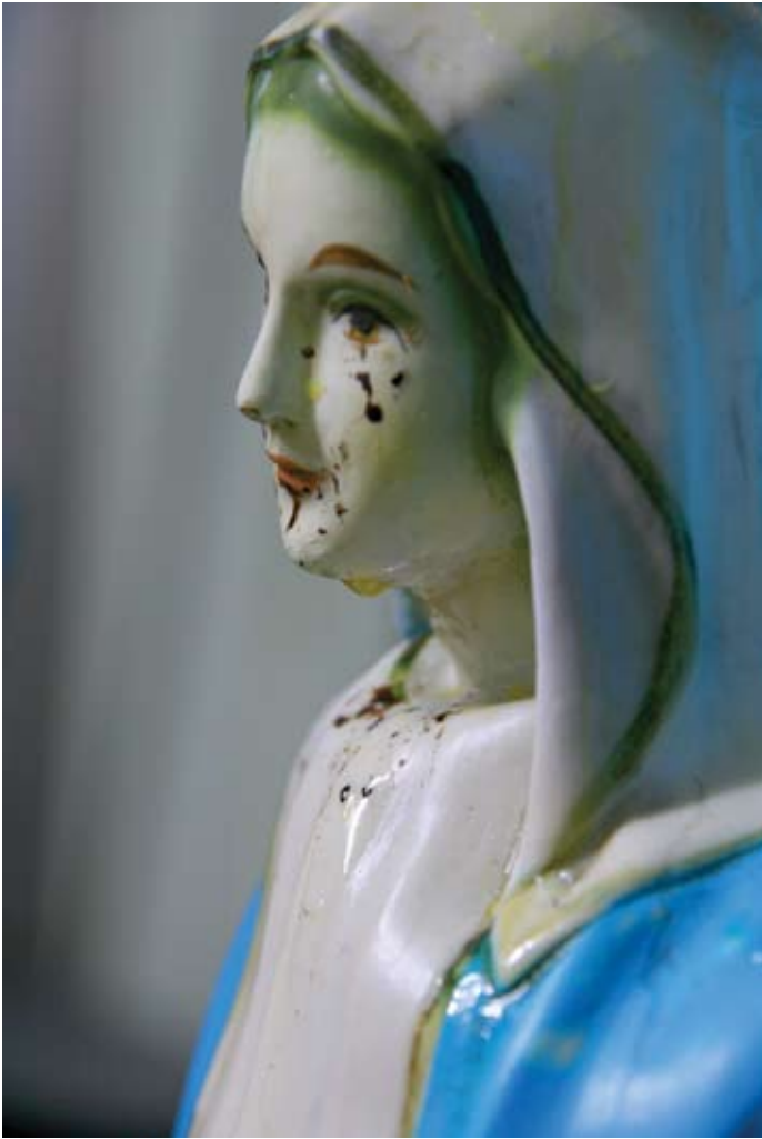
Our Lady's statue in Naju exuding golden-color fragrant oil on Holy Thursday 2006.