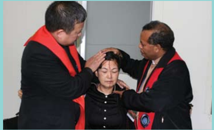
Two priests from the U.S.A. and Indonesia witnessed blood streaming down from the top of Julia's head.

430 N, 21st Street, Camp Hill, PA 17011 U.S.A