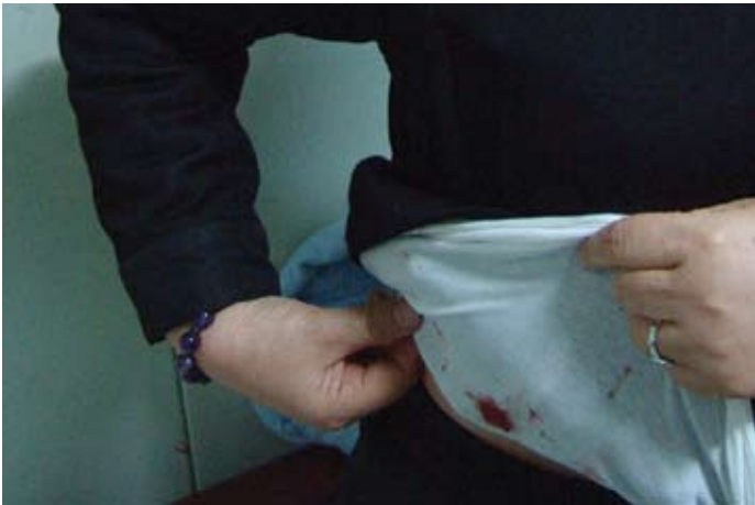
Bleeding from her side