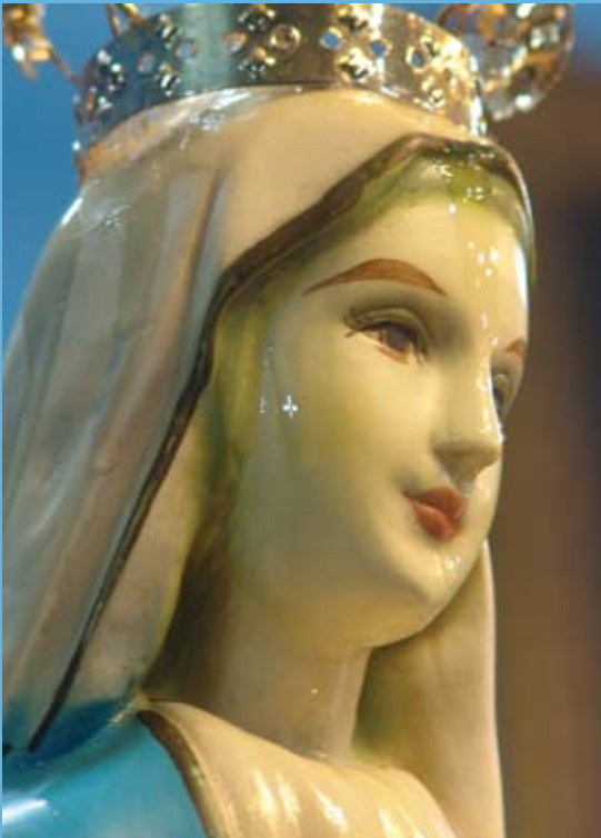
The Blessed Mother exuding fragrant oil through her statue in Naju (Oct 2, 2005)