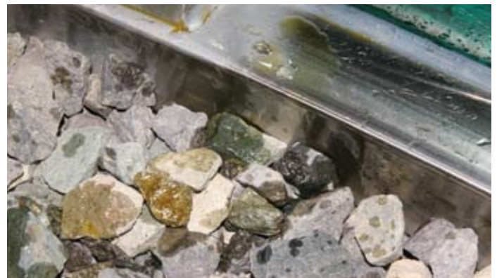
Fragrant oil that came down on the Blessed Mother's mountain

Suddenly, the water of mercy came down like a misty rain and also in larger drops making sounds of falling on the ground. When we were finishing the rosary prayer, Jesus on the Crucifix on Calvary Hill radiated powerful rays of the light of mercy on all gathered on the Blessed Mother's Mountain.