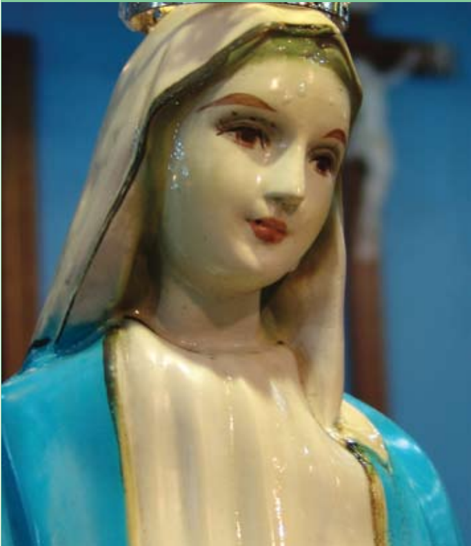
The Blessed Mother exuding fragrant oil through her statue in Naju (October 7, 2006)