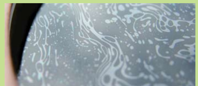
Fragrant oil is floating on the surface of the Blessed Mother's water of graces, displaying different colors.