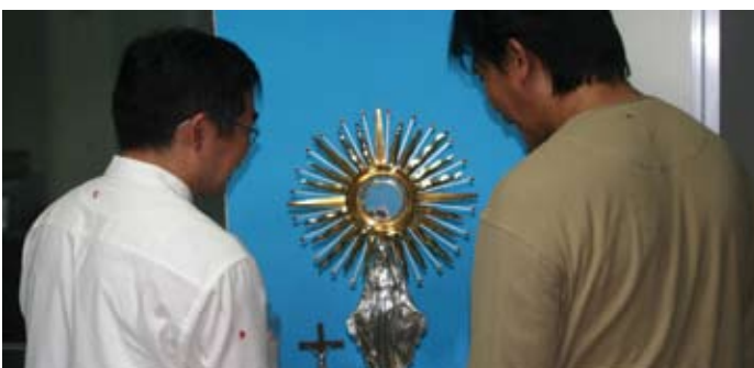
Our Lord's Precious Blood came down on the priests from abroad on July 1, 2006.

I wear the crown of thorns instead of the royal crown and am nailed to the cross because of the sins of the children in the world, and My Mother exudes fragrant