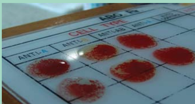
Samples of the Precious Blood descended on October 14, 2006 were tested at Naju General Hospital. The blood type of the samples was AB.